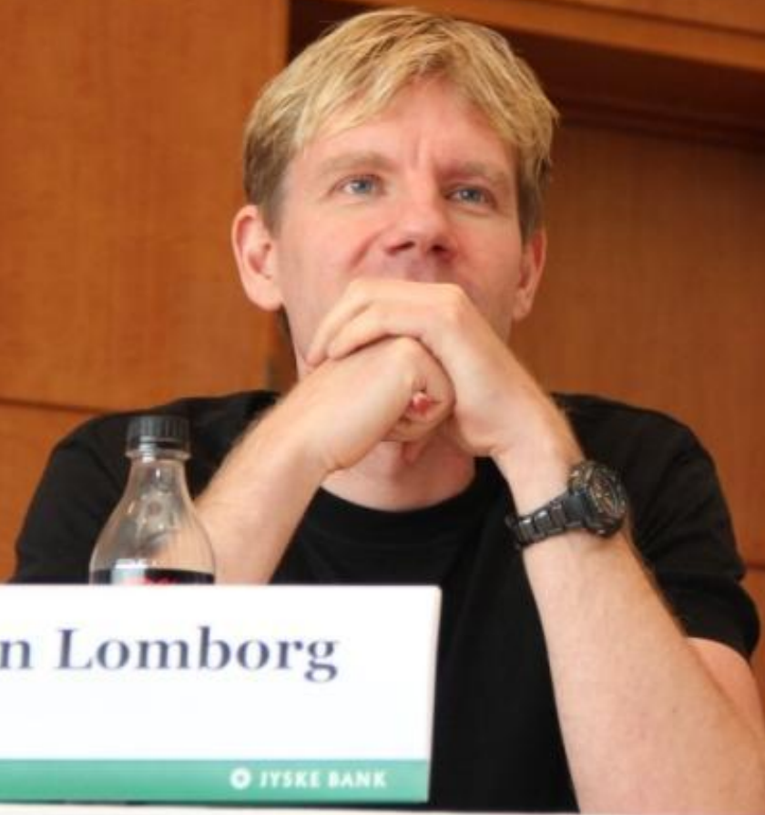
Bjørn Lomborg